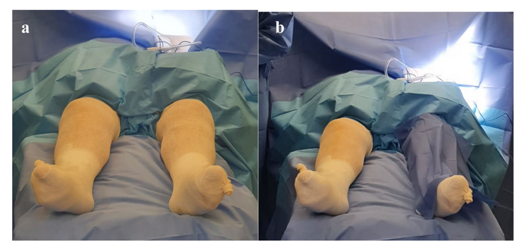
Fig. 1 a Surgical field preparation of both lower limbs set for approach. b Left knee covered before approaching right knee

BMI: body-mass index. ROM: range of motion. SD: standard deviation. KSS: Knee Society Score. VAS: Visual Analogue Scale