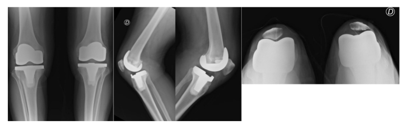
Fig. 3. 7.2 years of follow-up images. The right knee had patellar resurfacing and the left knee with patellar retention. No signs of loosening can be observed