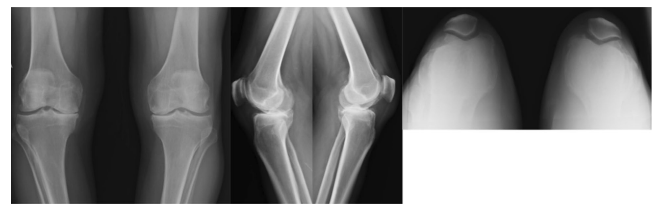
Fig. 2 Preoperative AP, lateral, and axial views of a 63-years-old male patient, with bilateral genu varus

Mechanical loosening was defined according to the Knee Society system [28], and infection was considered according to the Musculoskeletal Infection Society (MSIS) and, recently, the World's Association against Infection in Orthopaedics and Trauma (WAIOT) criteria [29, 30].